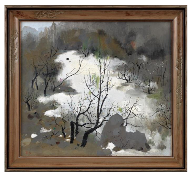
WU Guanzhong (1919–2010) Forgetful Snow Oil on canvas Painted in 1996 91 × 100 cm Est. HK$ 12,000,000–18,000,000