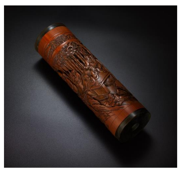
Early Qing Period A\ Bamboo\ Incense\ Holder\ Carved\ with\ Scholars\ in Literary 6.9\ (w)\times 22.5\ (h)\ cm