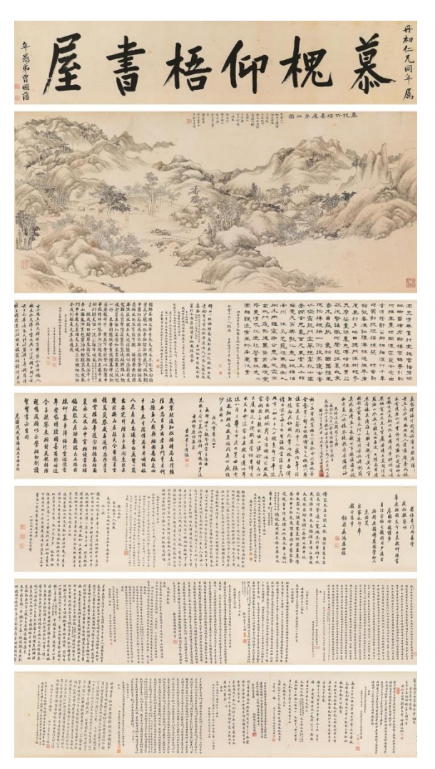
WANG Yinchang (19th Century)

Residence of Yan Jingming Handscroll; ink on paper Frontispiece: 39 \times 186.9 cm;