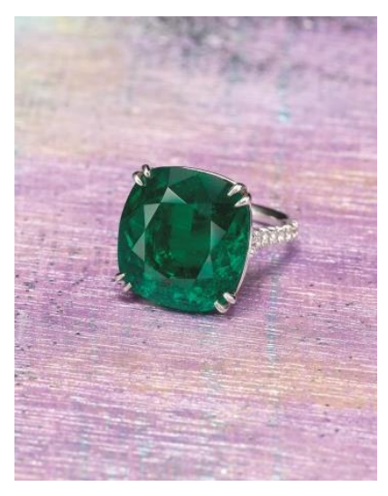
19.69-carat Natural Colombian Emerald and Diamond Ring Estimate upon request