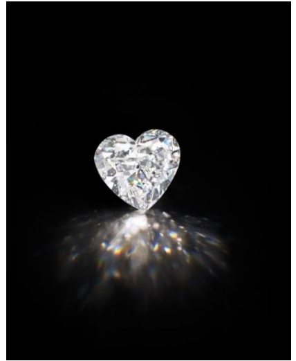
Unmounted 10.05-carat D-Colour Internally Flawless Type IIa Diamond Estimate upon request