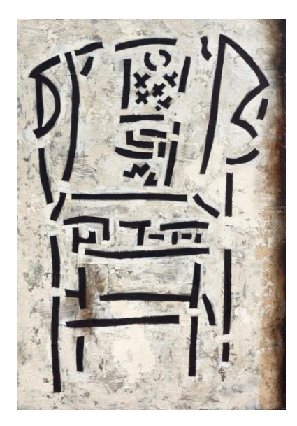
WANG Huai Qing (b. 1944)