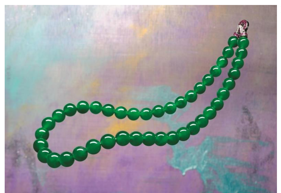
Magnificent and Rare Jadeite, Ruby and Diamond Necklace Estimate upon request

Institute of America (GIA) in 2010 as the largest it had ever graded and ranks among the handful of reddish orange diamonds ever certified by the GIA that weigh over 1 carat. Also remarkable is a 3.01-carat Natural Fancy Greenish Blue Internally Flawless Diamond, Pink Diamond and Diamond Ring. Following the spectacular results achieved for the jadeite necklace in April, the upcoming sale will feature another Natural Jadeite, Ruby and Diamond Necklace of superlative quality. Strung with 43 natural jadeite beads with the largest measuring 14 mm in diameter, each boasting an even and saturated green colour, extremely fine texture and excellent translucency, this jadeite bead necklace in the upcoming auction stands as a remarkable collecting opportunity for jadeite connoisseurs.