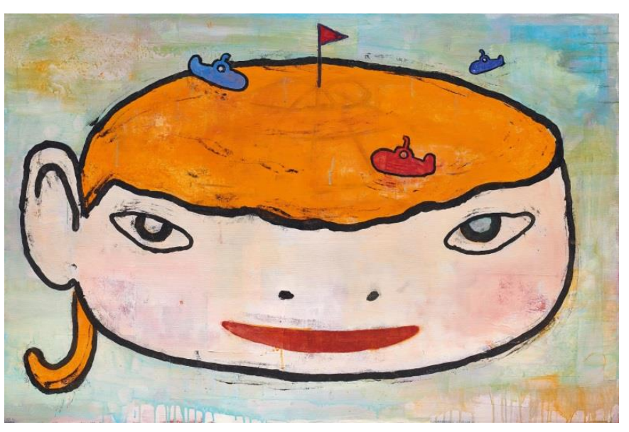
Yoshitomo NARA (b. 1959)