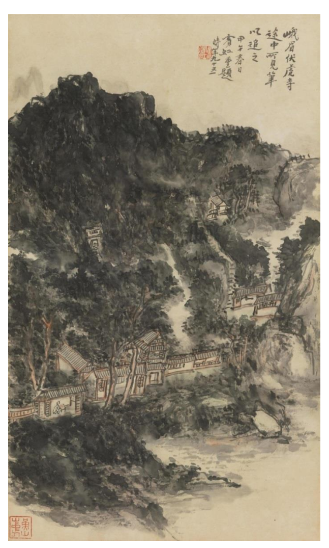
HUANG Binhong (1865–1955) Temple in E'mei Mountain Hanging scroll; ink and colour on paper 67 × 40 cm

Painting: 46.2 \times 101 cm; Annotation: 46.2 \times 1,071 cm Est. HK$ 200,000–500,000