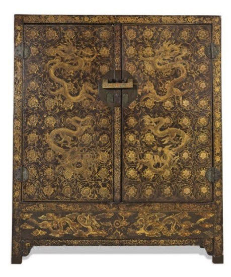
Late Ming/Early Qing Period Large Black Lacquered Square-Corner Cabinet with Dragon and Intertwining Lotus Pattern 185.5 \times 63.5 \times 218.5 cm