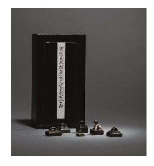
Six Bronze Seals Of various dimensions Est. HK$ 100,000–200,000