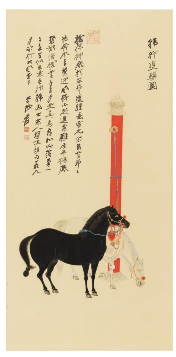
ZHANG Daqian (1899–1983) Horses after Han Gan Hanging scroll; ink and colour on paper Painted in 1947 130 × 63.5 cm Est. HK$ 12,000,000–18,000,000

FU Baoshi (1904–1965) Waterfall Hanging scroll; ink and colour on paper 81.5 \times 106 cm Est. HK$ 10,000,000 - 18,000,000