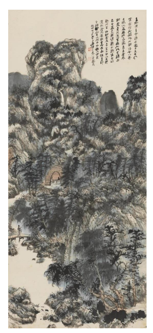
ZHANG Daqian (1899–1983) Landscape after Wang Meng Mounted for framing; ink and colour on paper Painted in 1963 116 \times 50 \text{ cm} Est. HK$ 4,000,000-6,000,000

FU Baoshi (1904–1965) Waterfall Hanging scroll; ink and colour on paper 81.5 \times 106 cm Est. HK$ 10,000,000 - 18,000,000