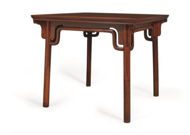
Late Ming Period Huanghuali Sqaure Table with Three-Spandrels Est. HK$ 1,600,000–2,600,000