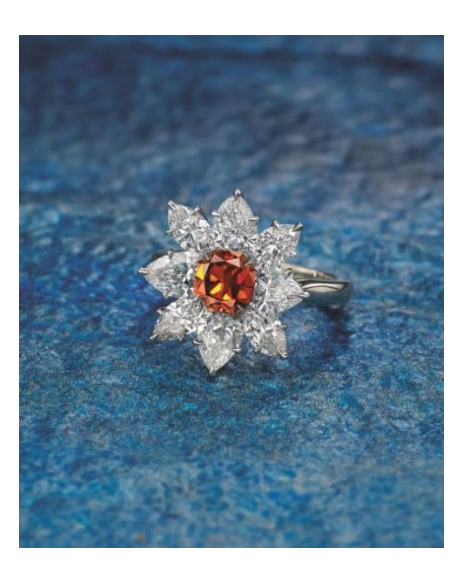
"A Ray of Hope-THE EMBER DIAMOND", a Magnificent 1.26-carat Fancy Reddish Orange Diamond and Diamond Ring Estimate upon request