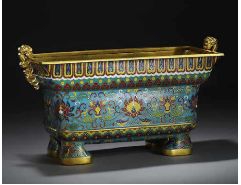
A Cloisonne Enamel Rectangular Censer With Dragon Handles

Qianlong Four-Character Mark and of the Period (1736-1795)