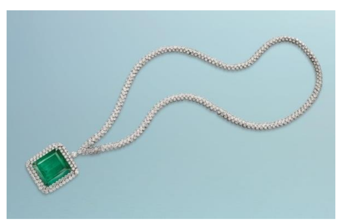
144.00-carat Natural Colombian Emerald and Diamond Necklace, Van Cleef & Arpels Estimates: HKD 7,000,000-9,000,000