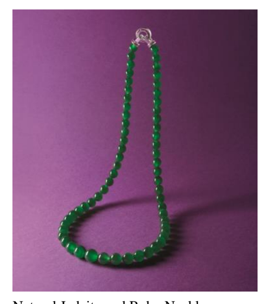
Natural Jadeite and Ruby Necklace Estimates: HKD 6,500,000 – 8,000,000