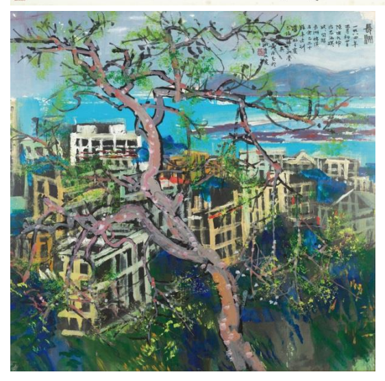
Huang Yongyu (b. 1924)

Li Keran (1907-1989) Five Buffalos Mounted for framing; ink and colour on paper Painted in 1987 67 \times 138 cm Estimate: HKD 5,000,000 - 6,000,000