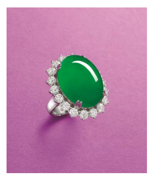
Natural Jadeite and Diamond Ring Estimates: HKD 6,500,000 – 8,000,000

Following the relaunch of the Jewellery, Watches and Luxury Goods Department last year, the specialist team at China Guardian (HK) continues to source for collectors the rarest and most coveted treasures while adhering to the valued China Guardian traditions of prudence, integrity and professionalism. Highlights of the Important Jewels and Jadeite sale this season include diamonds of superb quality, coloured gemstones, jadeite, Western antiques as well as modern luxury goods.