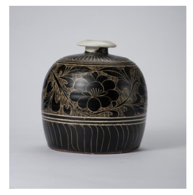
A Carved Black-Glazed