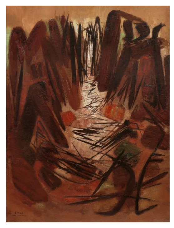
Chu Teh-Chun Composition No.57 Oil on canvas Painted in 1960 127 × 96 cm