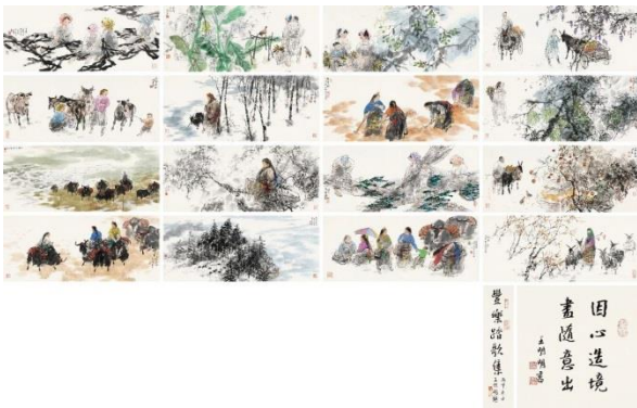
Lot 446 WANG Mingming (b.1952) Views in Seasons HK$ 5,900,000 / US$ 756,000