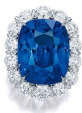
Lot 971 A Magnificent 49.06-Carat Natural Unheated Burmese Cornflower Blue Sapphire and Diamond Ring HK$ 16,250,000 / US$ 2,083,000