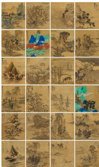
Lot 564 LAN Ying (1585-1664 or later) Landscapes HK$ 29,870,000 / US$ 3,829,000