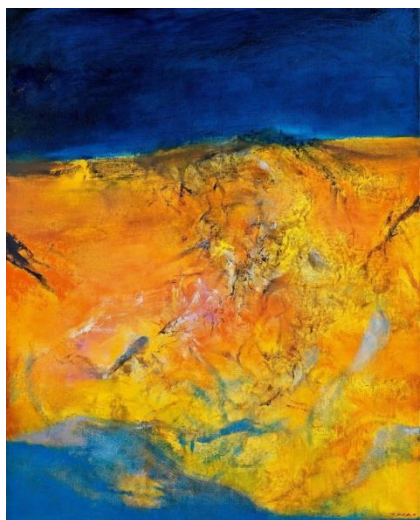
Lot 708 ZAO Wou-Ki (1920-2013) 01.03.99 HK$ 37,710,000 / US$ 4,835,000