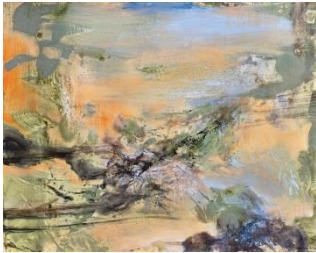
Lot 47 Zao Wou-Ki 21.01.76 HK$ 11,800,000/ US$ 1,512,800