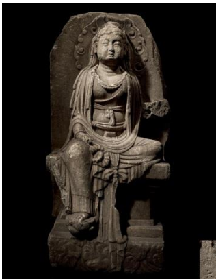
Lot 1048 A Large White Marble Seated Bodhisattva HK$ 9,810,000/ US$ 1,257,700