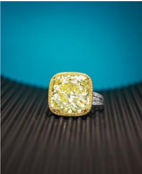
13.03-carat Natural Fancy Intense Yellow, Yellow Diamond and Diamond Ring Price Upon Request