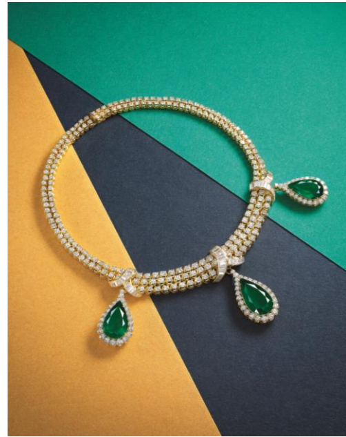
Very Impressive Total Weight of 33.21-carat Natural; Colombian Emeralds and Diamond Necklace, Boucheron Price Upon Request