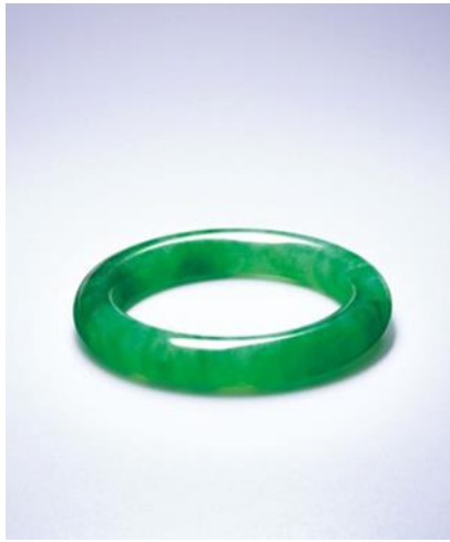
Extremely Rare Natural Jadeite Bangle Price Upon Request