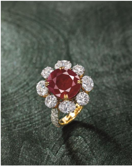
Rare 8.57-carat Natural Unheated Burmese Mogok Ruby and Diamond Ring HK$ 1,280,000