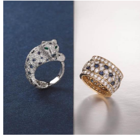
Left: Sapphire, Emerald and Diamond “Panthère” Ring, Cartier HK$340,000 Right: Sapphire and Diamond “Panthère Eternity” Ring, Cartier HK$100,000

Press releases and hi-res images can be downloaded via the link: https://www.dropbox.com/sh/om9c6e44pjfwghb/AAB3aZ3IirZtDvepcWhn9gnha?dl=0