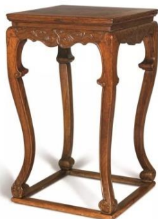
Ming Dynasty Huanghuali Square Incense Stand with Four Legs