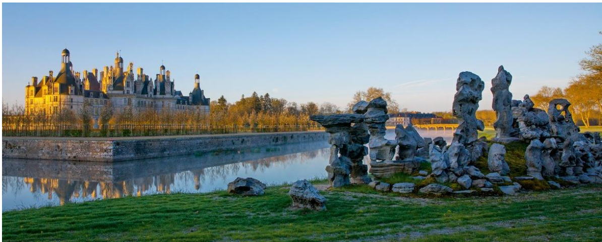
Scholar's Rocks exhibited at the banks of the Cosson River in France near the Château de Chambord