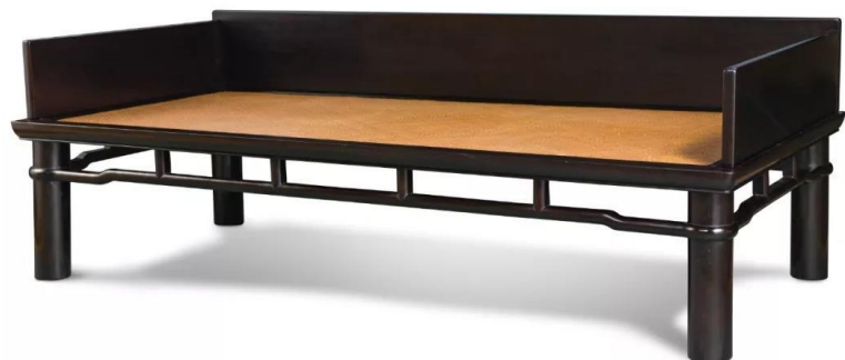
Late Ming /Early Qing Period

Est. HK$ 2.6 – 3.6 m / US$ 333,000 – 462,000