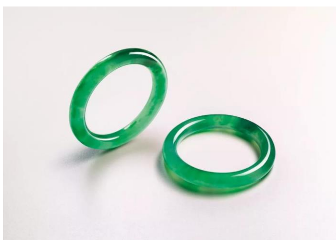
Very Rare Pair of Jadeite Bangles From an Important Asian Collection Estimate upon request

The upcoming 'Important Jewels and Jadeite' sale will bring to the market a careful selection of dazzling pieces, offering a total of nearly 200 lots with a total estimate in excess of HK$ 215 million. Highlights include a pair of superb Jadeite Bangles as well as an extremely rare Jadeite Cabochon Necklace Suite as well as other exquisite jadeite pieces, all preserved in an important Asian private collection for years. Diamonds in the sale will be represented by an important 4.58-carat Natural Fancy Purplish Pink Diamond and Diamond Ring. The sweetness of the purplish pink hue is perfectly complimented by the well-proportioned heart shape. As a rare gem that is highly sought after in the collecting community, pink diamond's value has withstood the test of time in the global market, making it an excellent asset for investment