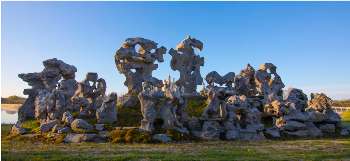
Oriental Garden: An Important Set of Scholar's Rocks | 1450 × 450 × 350 cm | Estimate upon request

creates an illusion of the idyllic Chinese landscape shrouded in mist. In 2018, these rocks were transported to the banks of the Cosson River in France for an exhibition that was part of the 500 th anniversary of the Château de Chambord, one of the most famous Renaissance castles in France .