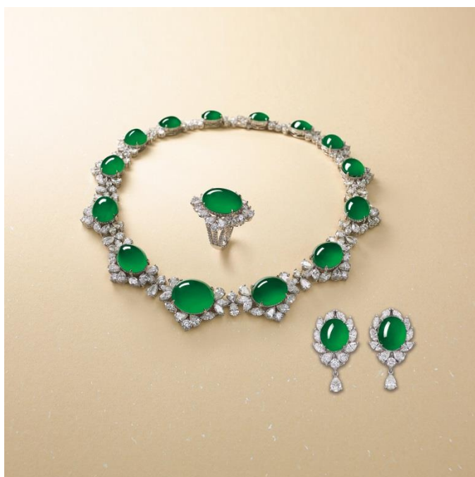
Extremely Rare and Important Jadeite and Diamond Necklace, Pair of Earrings and a Ring From an Important Asian Collection Estimate upon request