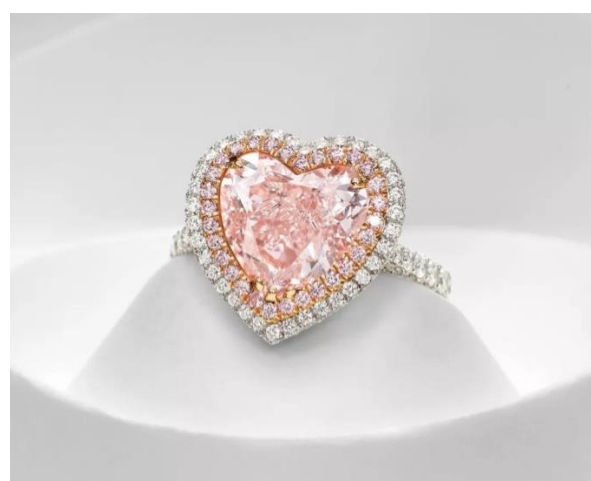
Extremely Rare and Impressive 4.58-carat Natural Fancy Purplish Pink Diamond and Diamond Ring Estimate upon request