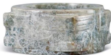
Lot 1066 An Archaic Jade Ritual Vessel, Cong , Neolithic Period, C.4th - 3rd Millennium BC Sold for: HK$ 4,484,000