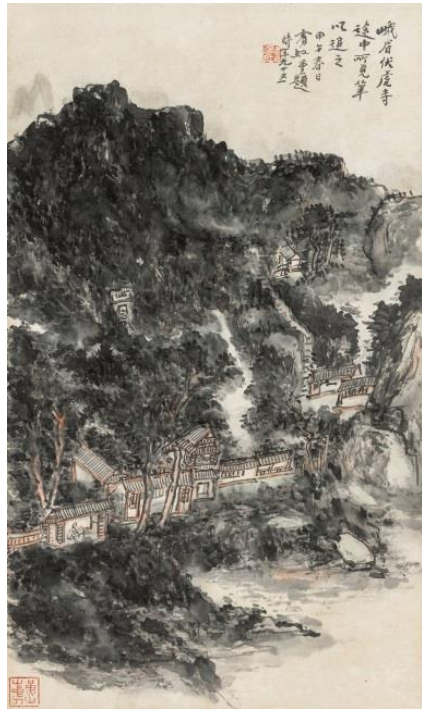
Lot 1428 Huang Binhong (1865-1955) Temple In E'mei Mountain Sold for: HK$ 9,465,000