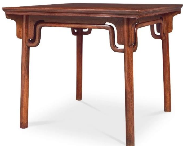
Lot 436 Huanghuali Square “Immortals” Table with Three Spandrels, Late Ming Period Sold for: HK$ 4,130,000