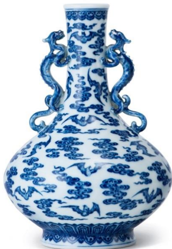
Lot 569 A Very Rare Blue and White “Bats in Cloud” Vase, Qianlong Period Sold for: HK$ 9,350,000