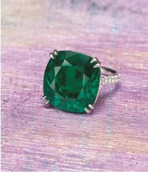
Lot 355 A 19.69-Carat Natural Untreated Colombian Emerald and Diamond Ring Sold for: HK$ 20,620,000