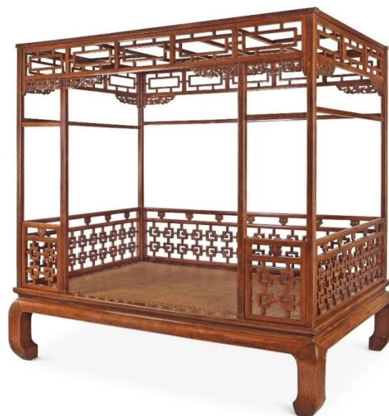
Lot 431 Huanghuali Six-Post Canopy Bed , Early Qing Period Sold for: HK$ 2,124,000