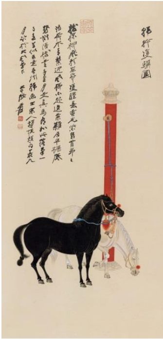
Lot 1521 Zhang Daqian (1899-1983) Two Horses Sold for: HK$ 13,950,000