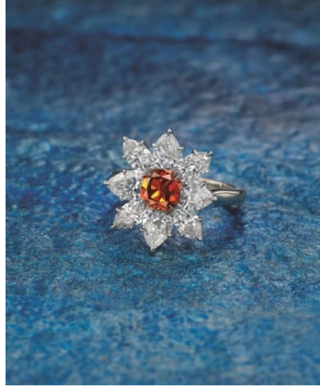
Lot 360 “A Ray of Hope - The Ember Diamond” A Magnificent 1.26-carat Fancy Reddish Orange Diamond and Diamond Ring Sold for: HK$ 16,250,000

Prices achieved include the hammer price plus buyer's premium Press release and hi-res images can be downloaded via the link: