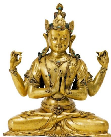
Lot 869 A Gilt-Bronze Figure of Four-Armed Guanyin, 18th Century Sold for: HK$ 1,770,000