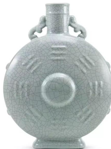
Lot 599 A Magnificent Ge-Type “Bagua” Moonflask, Baoyueping , Yongzheng Period Sold for: HK$ 5,900,000