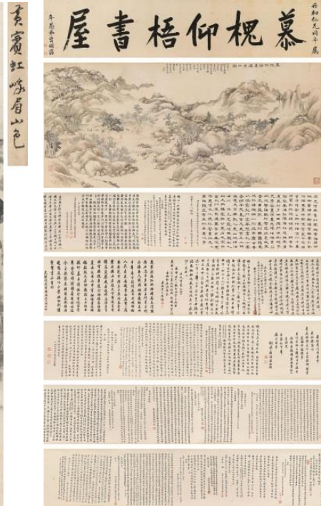
Lot 1737 Wang Yinchang (19th Century) Landscape of Muhuaiyangwushuwu, Residence of Yan Jingming Sold for: HK$ 8,200,000