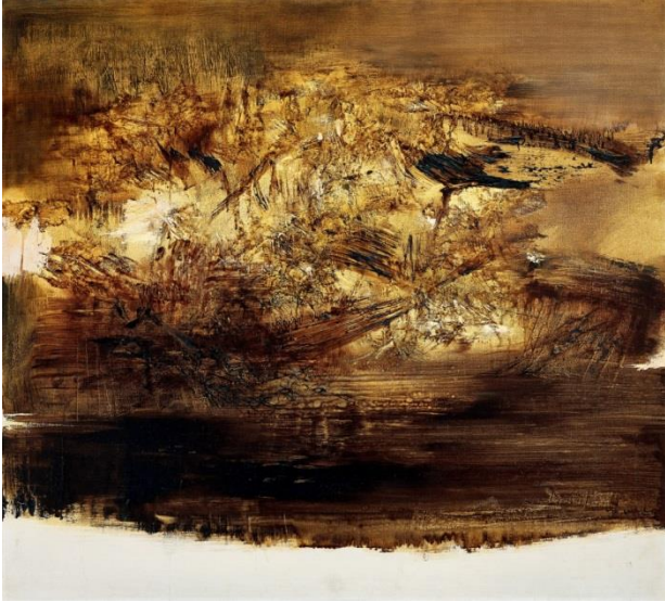
Lot 56 Zao Wou-Ki (1921-2013) 06.10.68 Sold for: HK$ 17,400,000