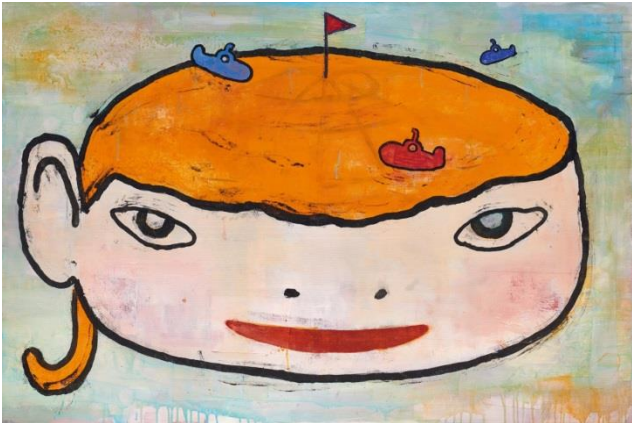
Lot 106 Yoshitomo Nara (b.1959) Submarines in Girl Sold for: HK$ 12,225,000