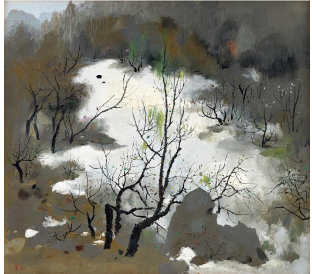
Lot 45 Wu Guanzhong (1919-2010) Forgetful Snow Sold for: HK$ 16,250,000